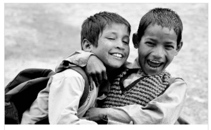
Think Equal Empowering Change Through Education

(This closure will be reflected in your preschool invoice).